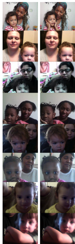
Figure 1. Cropped examples of webcam video frames of children looking to the reader's left (left column) and right (right column).

Each session of the preferential looking study was coded using VCode (Hagedorn et al., 2008) by two coders blind to the placement of test videos. Looks to the left and right are generally clear; for examples, see Figure 1. Three calibration trials were included in which an animated attention getter was shown on one side and then the other. During calibration videos, all